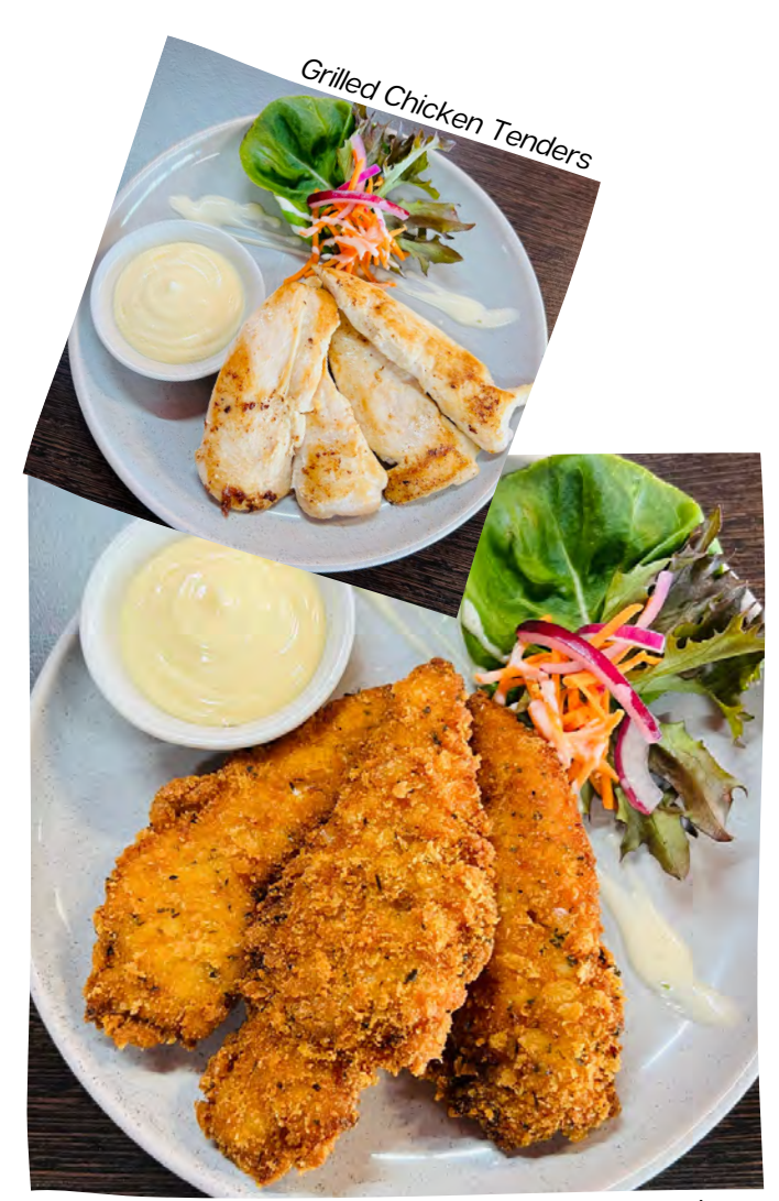
Crumbed Chicken Tenders