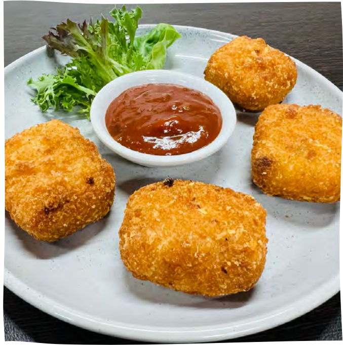
Mac 'n' Cheese Bites